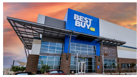
First Park @ PV303 - Building C Goodyear, AZ